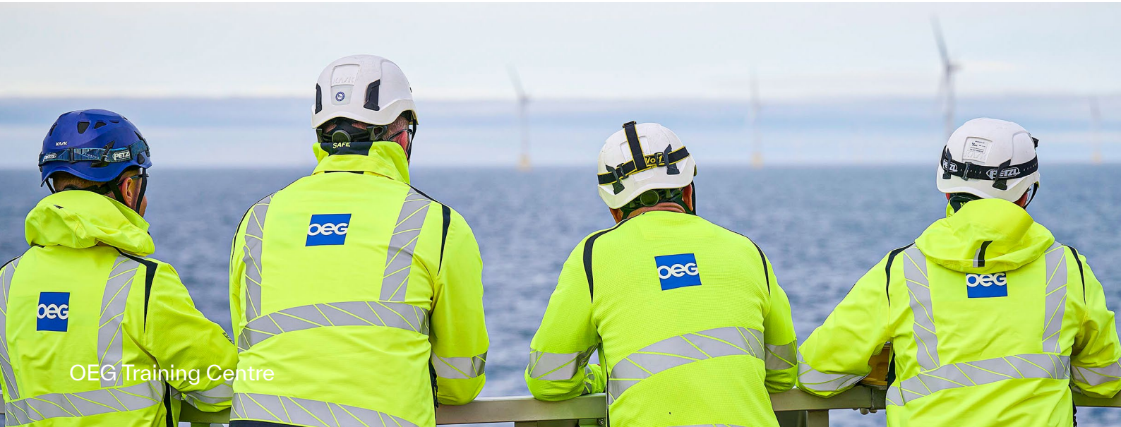
OEG Training Centre